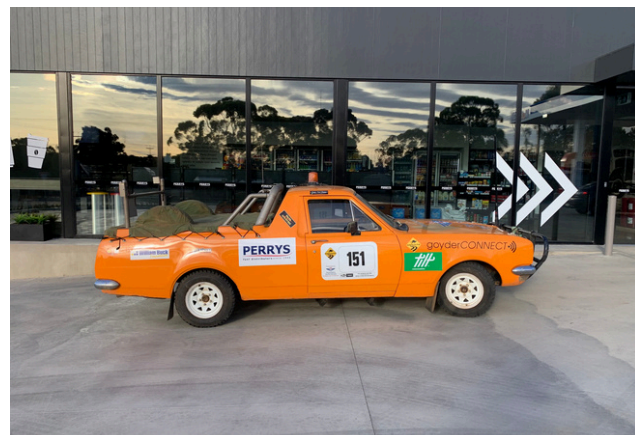
Figure 6: RFDS Outback Car – 2023 and 2024