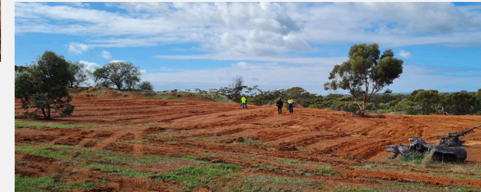
Figure 9: Yued Mob and local staff planting the seedlings