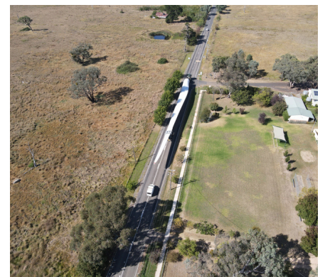
Figure 4: Last turbine blade delivery March 2024

The last turbine was delivered to site and installed in April.