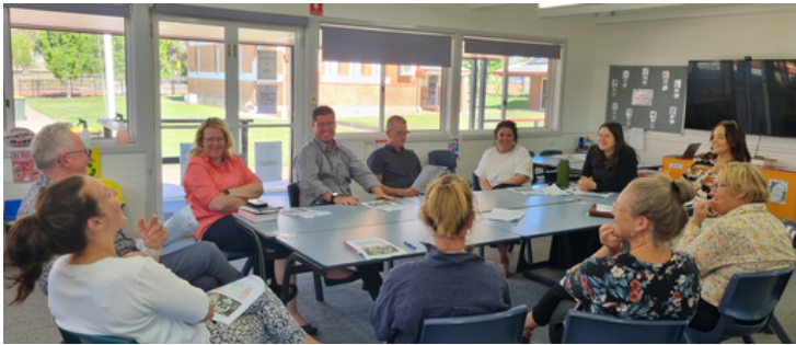
Figure 2: Educators and support staff completing a training session.

In November 2024, emotional regulation and resilience training sessions were held for educators and support teams at local schools. These sessions covered key topics like trauma, resilience, and social-emotional skills, with more training planned for early 2025.