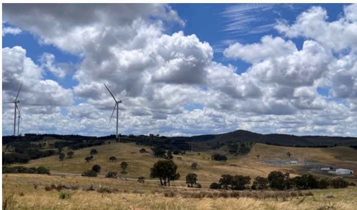
Figure 1: Rye Park Wind Farm, fully operational.