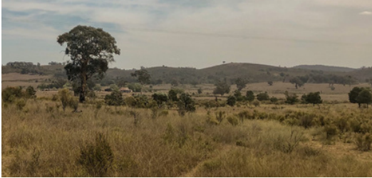
Figure 1: Rye Park pre-construction.

The project received its initial Development Consent in 2017. Following this, various approvals and modifications were granted, including a significant modification in April 2021 and another in September 2022. Construction began in late 2021 and as of October 2024, Rye Park Wind Farm entered full operations!