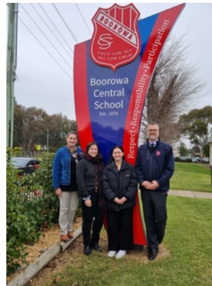
Figure 1: Staff at the Boorowa Central School

For any civic-minded community members who may be interested in joining these committees, please reach out to each council directly.