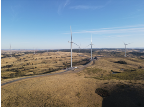
Figure 3: Recently erected turbines facing north during 2023.

Construction commenced, with construction contractor Zenviron (and their subcontractors), continuing to mobilise staff and equipment resources to the Project.