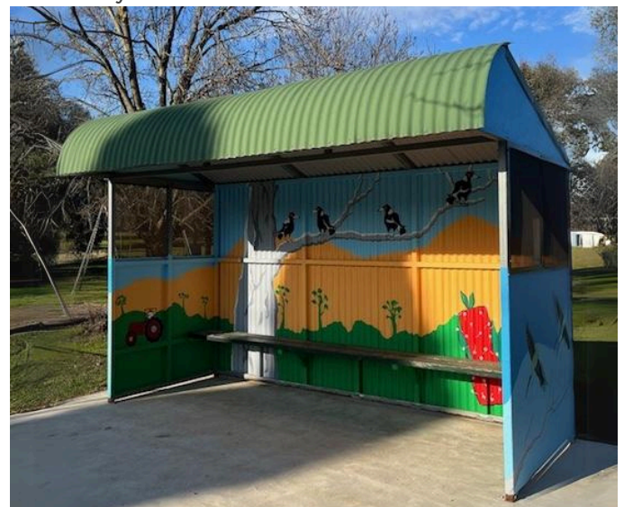
Figure 4: Rye Park Bus Shelter

More information is available on our website or get in touch with your local council.