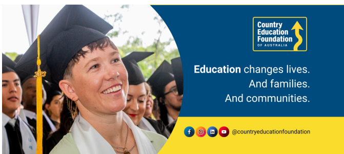
Figure 3: Country Education Foundation

CEF has 46 local foundations across the country working to support local youth to achieve their study and career aspirations. Their local foundations are run by volunteers passionate about helping rural and regional young people to achieve their dreams.