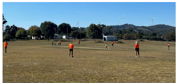
Figure 2: Local Cricket Legends