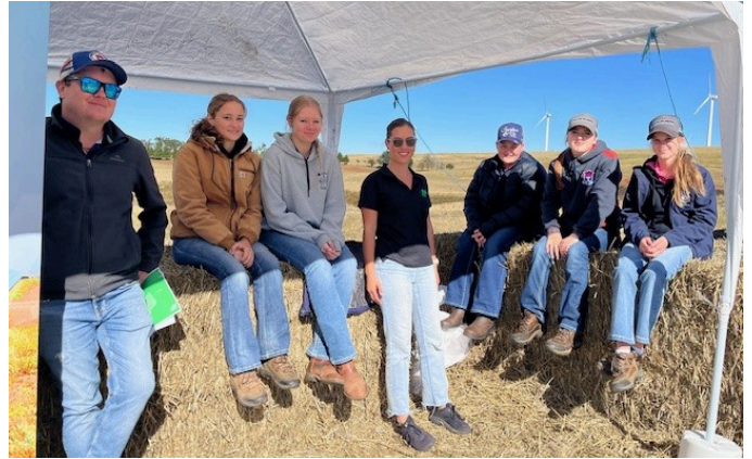
Figure 5: AgTech & STEM Careers Expo

Tilt Renewables prioritises fire management at all our sites and coordinates closely with emergency services to keep our neighbours safe. Experience has shown our wind farms are a low fire risk. They can also improve firefighting capability by increasing access roads and firebreaks.