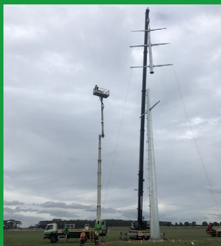
Transmission pole erection