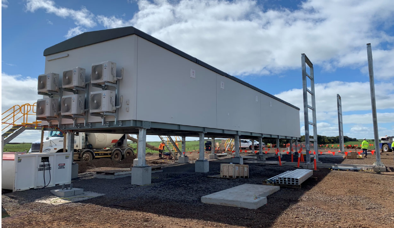
Wind farm substation switchroom delivered

The Tilt Renewables team is underway with constructing the $560 million Dundonnell Wind Farm located approximately 23 kilometres north-east of Mortlake, in the Western District of Victoria. AusNet Services are constructing 38 kilometres of 220kV transmission line and a substation which will connect the wind farm to the electricity network.