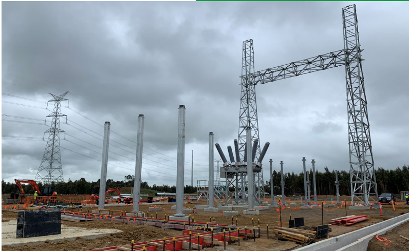
Structural supports and instrument install at BGS

In the Mail “The first batch of international wind turbine tower sections are on the water and are expected to arrive in the Port of Portland by the end of the month. Locals can expect tower sections on the roads and heading up to the wind farm construction site in the coming weeks. Fabrication of the local Keppel Prince tower sections are set to commence out of their Portland factory next week ”