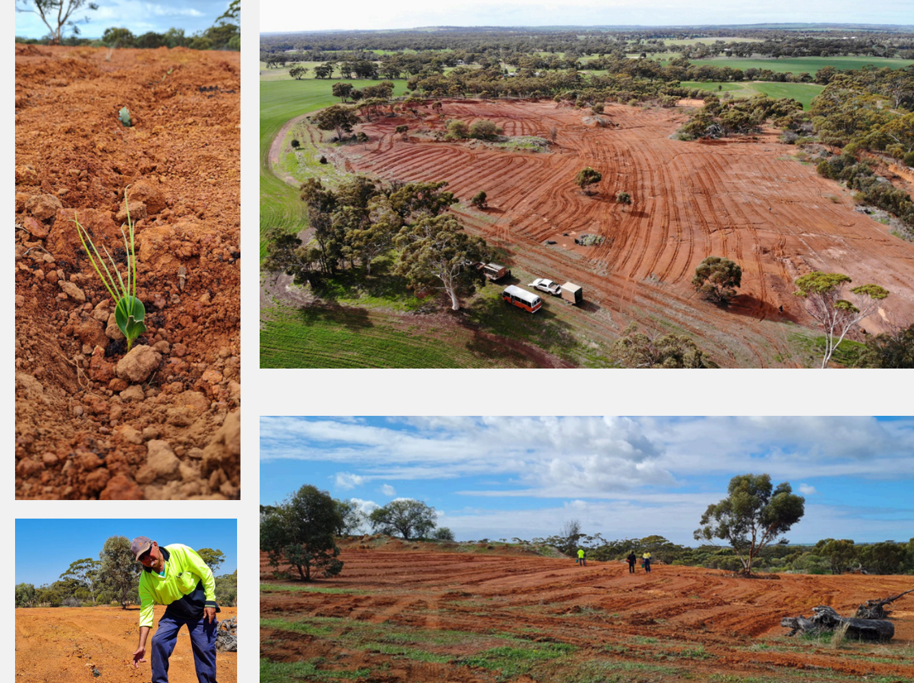
Figure 9: Yued Mob and local staff planting the seedlings

Since 2019, Tilt Renewables has supported five local students to attend university.