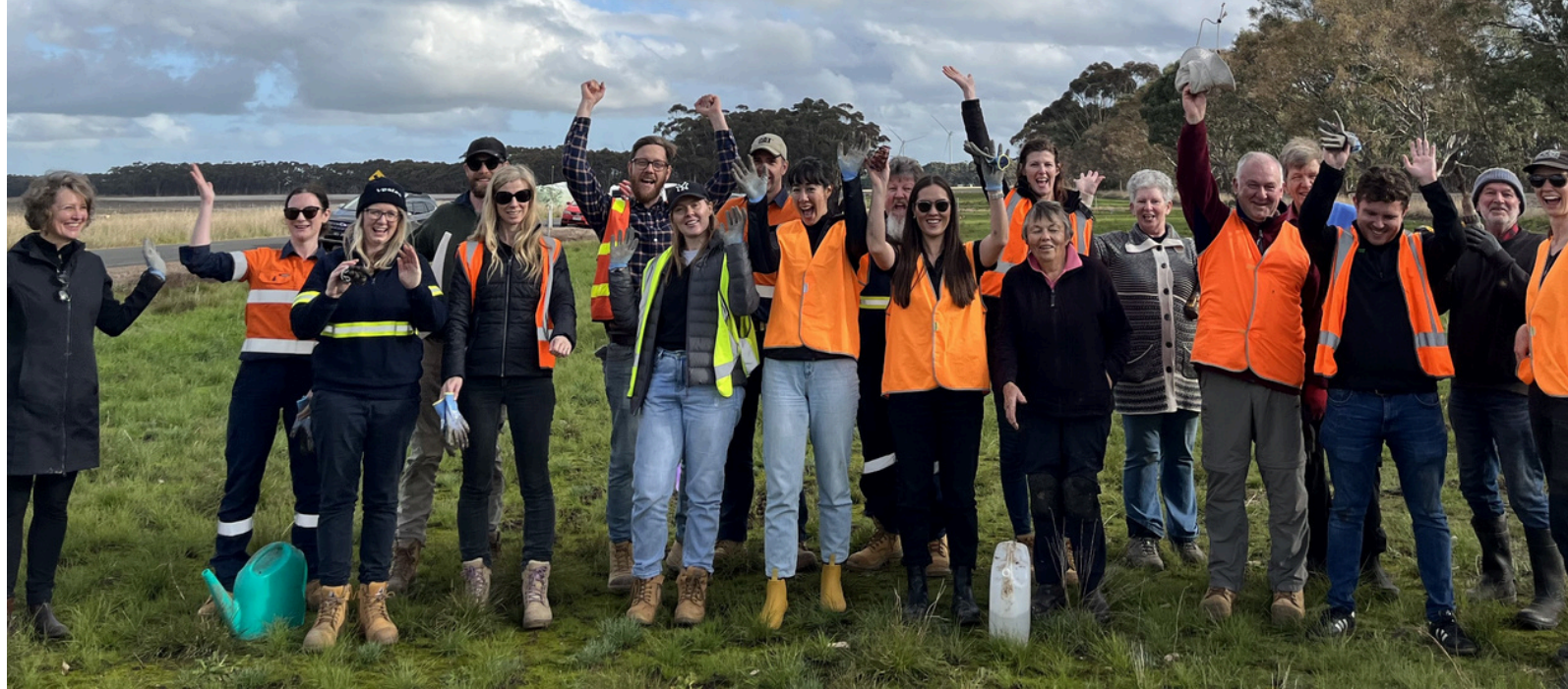
Figure 7: Tilt Renewables staff with WCLG representatives – ready to plant

Tilt Renewables' support of Team Cobber helps ensure that the RFDS can meet health demands in rural areas.