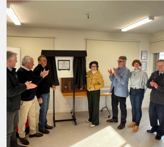
Figure 4: Tilt Renewables Chief Operation Officer (far-most left) with community representatives at the Dundonnell CFA Shed Opening

After speaking with the Community Fund Committee and Dundonnell Hall Committee, Tilt Renewables set aside 50% of the Dundonnell Wind Farm community fund ($25,000 per annum over 10 years) to service a loan for the development of a new CFA shed in Dundonnell, Victoria. The new fire station provides community access to an improved and suitable facility for public use and for fire-fighting operations.