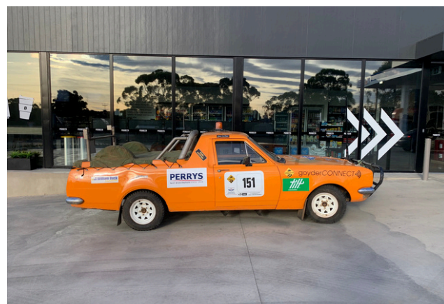
Figure 6: RFDS Outback Car – 2023 and 2024