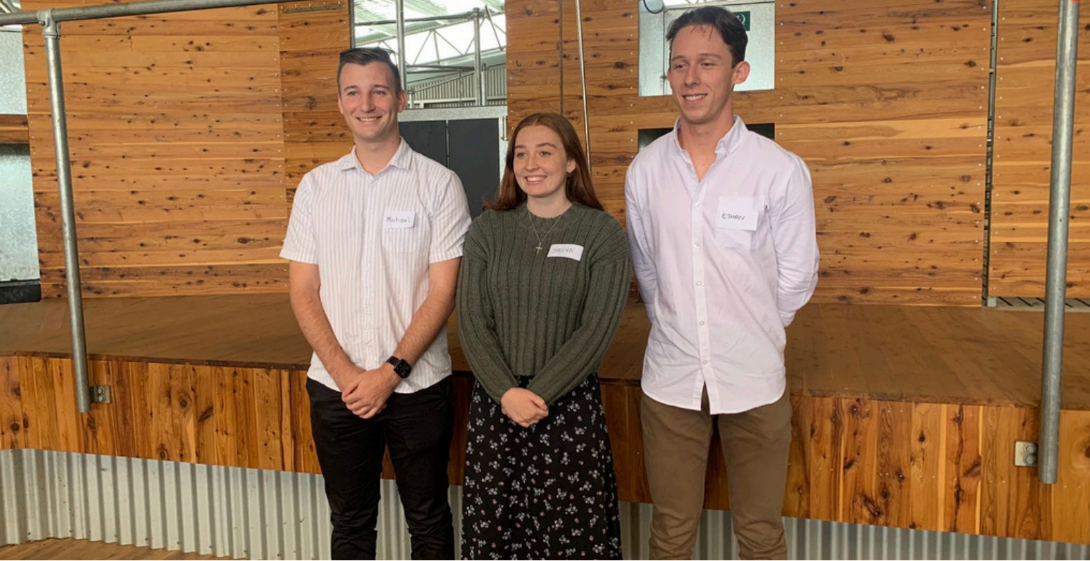
Figure 8: Salt Creek Wind Farm Scholarship Recipients