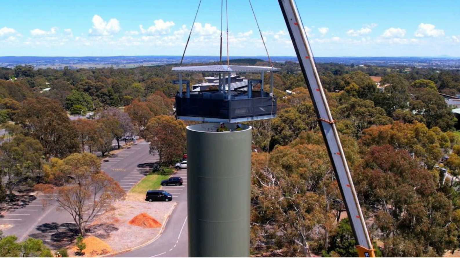
Figure 3: The Asia Pacific Renewable Energy Training Centre Wind Turbine Tower